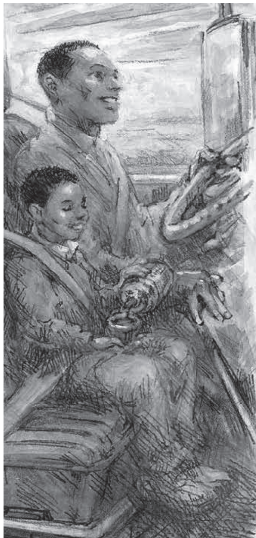
© Illustration by D. Brent Burkett