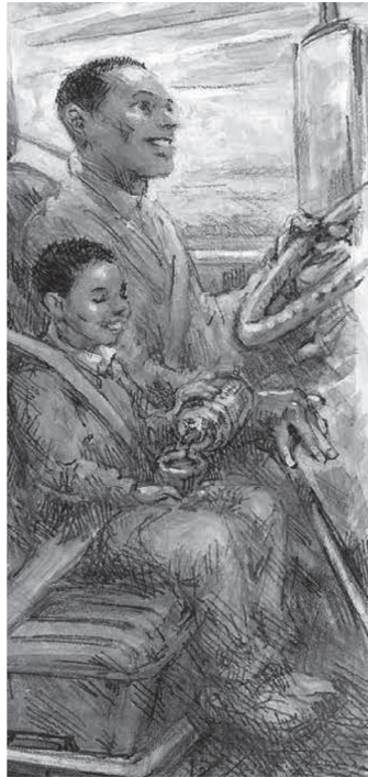
© Illustration by D. Brent Burkett